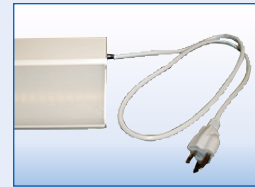
PC – 6' POWER CORD 18/3 Cord with U Ground Plug. White Standard (For Non-Dim)