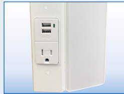
USB – DUAL USB OUTLET Grounded 15A Convenience Outlet