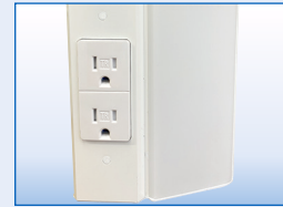
DU – DUPLEX OUTLET Grounded 15A Convenience Outlet