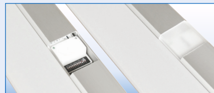
MS MOTION SENSOR