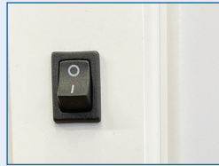
SW120 – SWITCH 120V SW277 – SWITCH 277V HLSW – HI/LO SWITCH