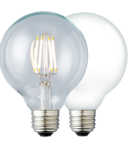
G25, 3.5W, 350L G25/C/24/350 24K, CLEAR G25/W/24/350 24K, WHITE G25/C/27/350 27K, CLEAR G25/W/27/350 27K, WHITE