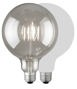
G40, 4.5W, 500L G40/C/24/500 24K, CLEAR G40/W/24/500 24K, WHITE G40/C/27/500 27K, CLEAR G40/W/27/500 27K, WHITE